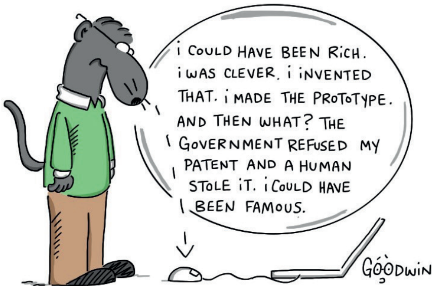
GRIMACING MOUSE DISCOVERS FAE.

These studies showed that FAE is less of a universal human behaviour than previously thought, and that it is instead affected by a person's culture.